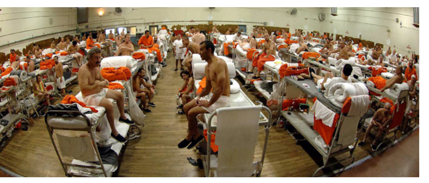
Overcrowding in a California prison.